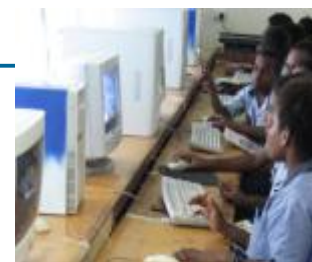
TISOL Students utilizing Information and Communication Technology (ICT) to assist their learning

Papua New Guinea has a rich history and tradition of complex technology designed to meet the needs of life in a sometimes hostile environment. As PNG moves rapidly to adopt many aspects of western society it becomes a fascinating environment for the study of diverse technologies.